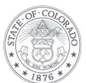
Exhibit 3 - CPW Recommendation Letter